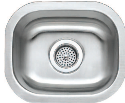
NOMINAL DIMENSIONS Model 1512UM18 shown